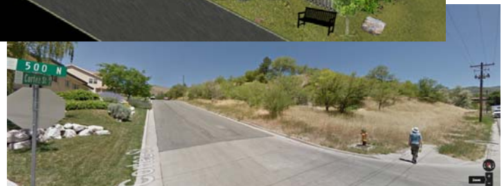
Existing 500 North Cortez pump station site