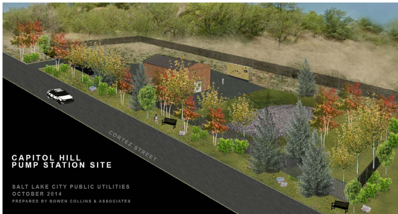
New 500 North Cortez Pump Station